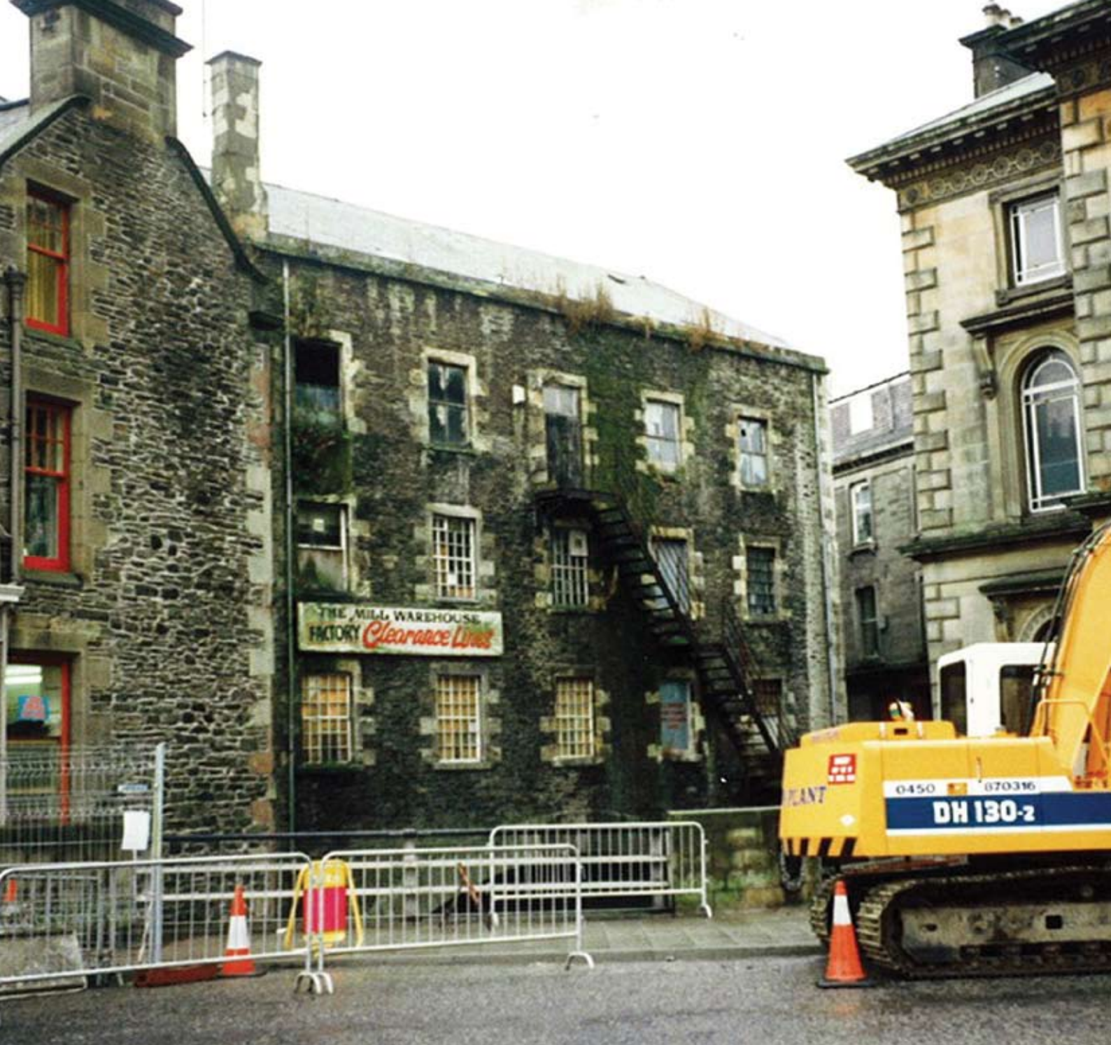
Tower Mill, Hawick - Before