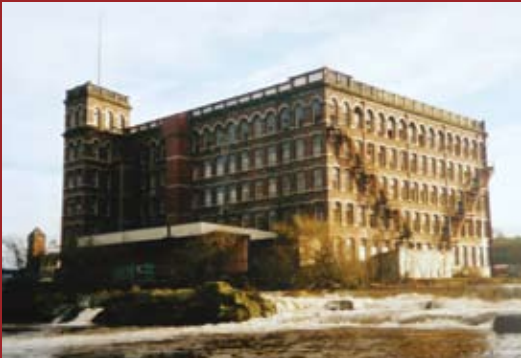
Domestic Finishing Mill, Anchor Mills, Paisley The Anchor Mills complex was founded in 1812. Completed in 1886, the Domestic Finishing Mill had a working life of nearly 100 years, finally closing in 1983. As a building, this Category A-listed structure is unusual. It has a primarily red brick exterior supported by cast-iron columns round a central atrium. The complex enjoys a central location in Paisley. Since production ceased, development

pressures have led to the demolition of all but two of the buildings: the Domestic Finishing Mill and the West Gate House. A number of B-listed buildings were lost including the Counting House, Linside Thread Works and Kilinside House. Interest in finding a new use for the mill revived in 1996 with a proposal to convert it into 87 flats. Despite the granting of outline planning consent, and a letter of support from HRH, The Prince of Wales, the scheme failed to proceed and in 1998 the site was sold to Safeway, who wished to build a superstore on the adjacent site (formerly the site of Linside Mill) with a promise to renovate the mill. In 1999 the Phoenix Trust was brought in to work with Safeway and the council on the renovation. It was agreed to pursue a scheme involving the conversion of the ground floor to parking, the first floor to commercial and the upper floors to residential. The work was completed in 2005 with the official opening taking place on 21st June.