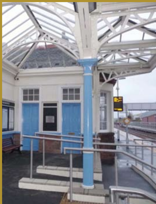
Laurencekirk Station, Before