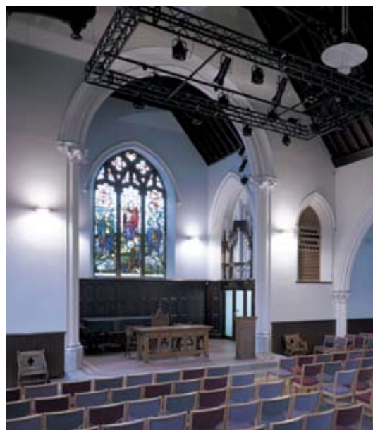
Fotheringay Centre, Glasgow, After

The last decades of the 20th century saw dramatic changes to our ecclesiastical fabric. Redundancy became commonplace, frequently with the threat of demolition. Out of this concerning situation, the creative adaptation and reuse of Scotland's church buildings has grown in recent years. In addition, a number of organisations have been established which specifically address the problem, such as the Scottish Redundant Churches Trust and the Church Buildings Renewal Trust. Many people and organisations have risen to the challenge of bringing back into use. A survey by the Scottish Civic Trust in 2006 found over 130 new uses to which churches have been put.