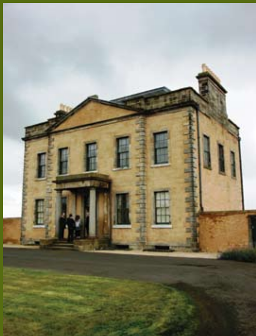
Blackburn House (Rear), West Lothian, Before